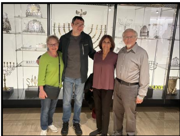
Chaverim trip to the Jewish Museum