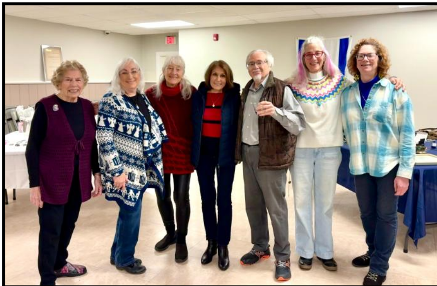
from the Chaverim Havdalah & Swap—November 15