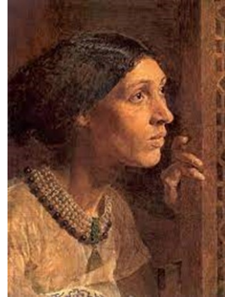
Sisera's Mother (1861) by Albert Joseph Moore (1841–1893). Tullie House Museum and Art Gallery