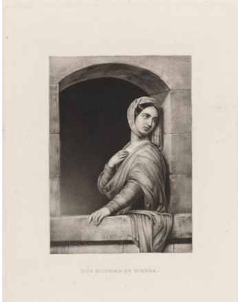
Sisera's Mother (undated) by John Gadsby Chapman (1808–1889).