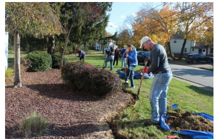
Photos from Daffodil Planting