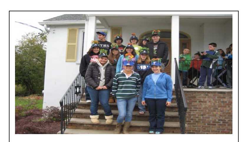
Confirmation Class Celebrates Sukkot!