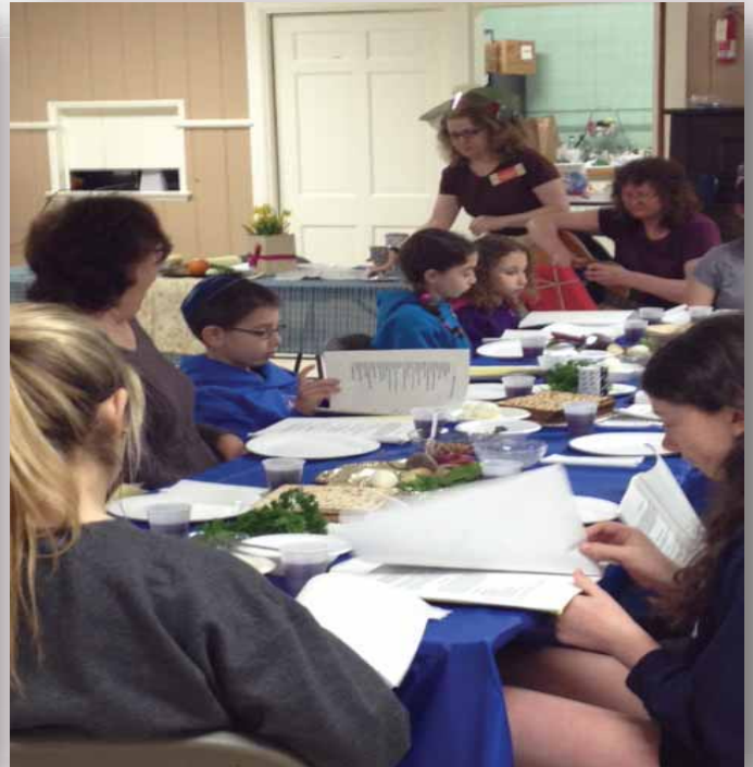
Model Seder and Passover Craft 2014