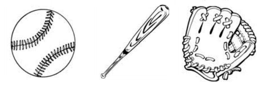
Deadline to reserve your tickets is May 10th

To reserve your tickets or for more information, please contact Tracey Bauer at <u>traceysbauer@comcast.net</u> or (908) 876-4451