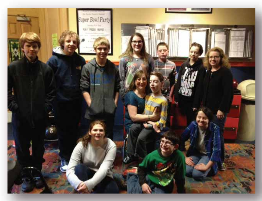
The teens of the JCNWJ enjoyed socializing and bowling together.

Everyone had a fun time at the annual JCNWJ Tu Bishvat seder. There was singing and lots of eating, as the kids and teachers enjoyed trying a variety of fruits and nuts. New to the fruit offerings this year were cherries and papaya.