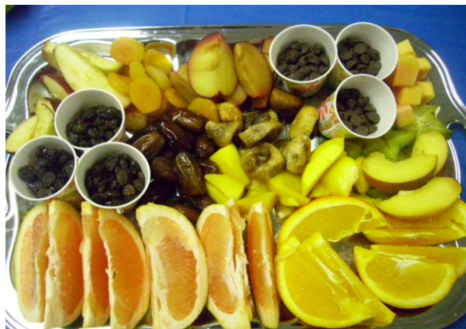
PTO members prepare Tu'Bishvat fruit platters for the annual Tu'Bishvat seder.