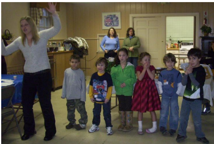
Kindergarteners celebrate Tu'Bishvat, singing and dancing at the seder.