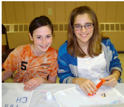
Hebrew School students participate in a Chanukah Craft, creating Chanukah Flags.