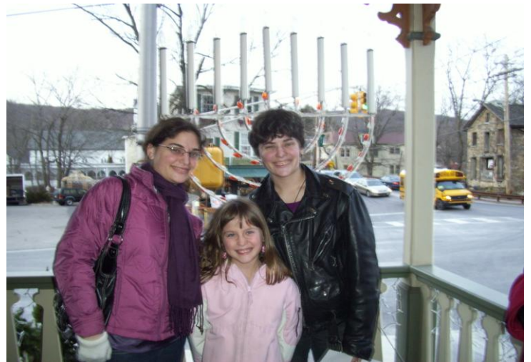
Everyone enjoyed the Candle Lighting at Splash Restaurant on the last day of Chanukah.