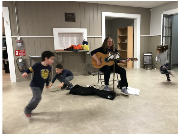
Sunday School Hanukkah Celebration 12/15/19