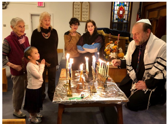
Hanukkah at the Temple 12/27/19