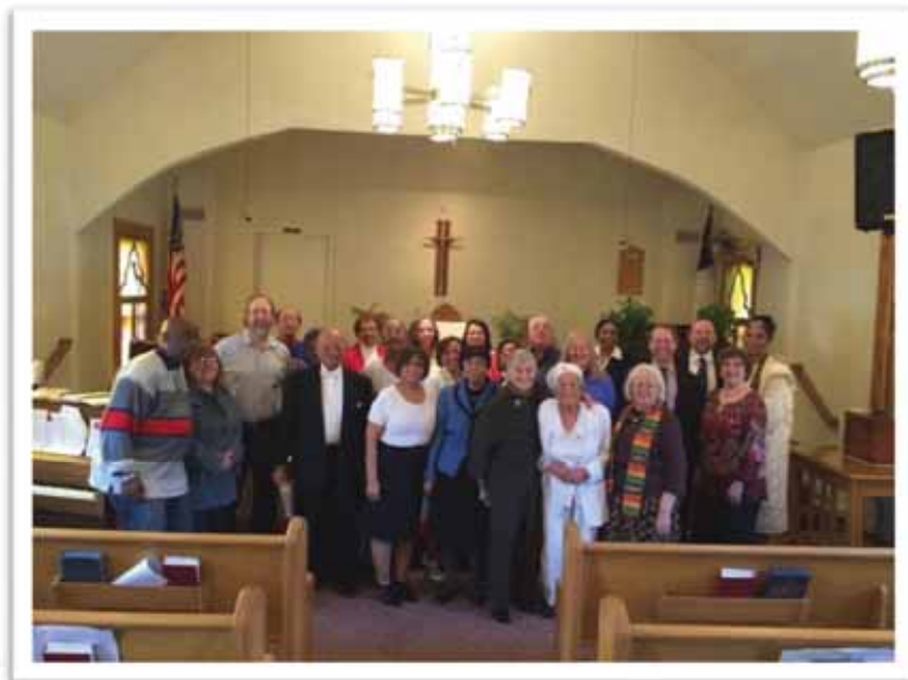
Eleven JCNWJ members visited Mt. Pisgah AME Church in Washington in February.