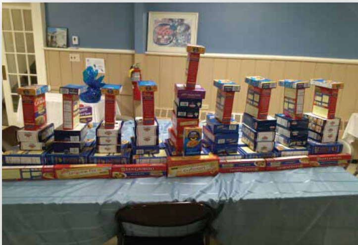
The JCNWJ's first annual Great Menorah Pasta Box Build was a huge success! Over 100 boxes of pasta were donated to local food banks.