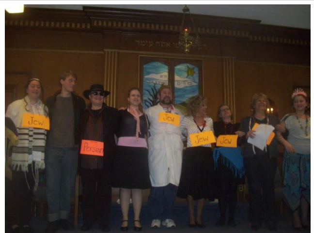
The Purim Spiel Cast takes a well deserved bow following their crowd pleasing performance of Middle East Side Story .