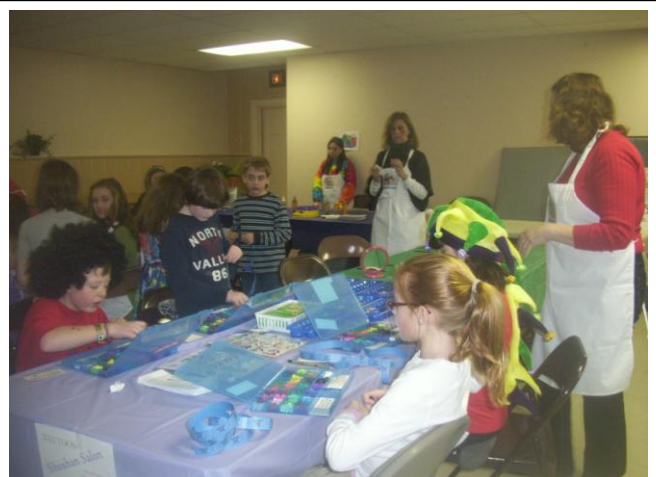
Children of all ages enjoy another fun-filled Purim Carnival sponsored by the PTO.